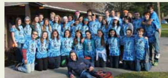
Thirty-eight teens made the 2014 spring retreat at Camp Cheerful.

Youth ministry gives so much to our young people in many different ways: vocations, peace, truth, charity, service, faith, friendship, mentorship, and more.