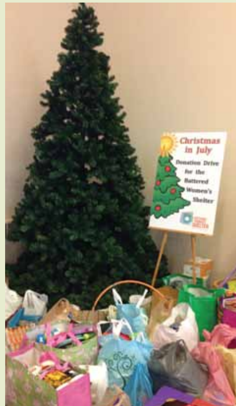
Parishioners generously stocked the shelter's shelves during the parish's first Christmas in July donation drive.