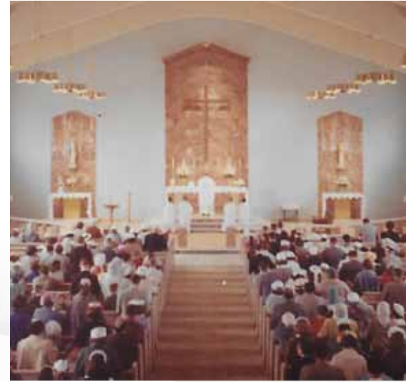
Pre-Vatican II Mass in the new church, June 1961.

some change, including the removal of a few pews in the middle to form a cross aisle. Steve says a $3.5 million proposal in the late 1970s or early 1980s to convert the rectangular sanctuary into a "church in the round" by moving the altar to the west wall proved quite unpopular and was abandoned.