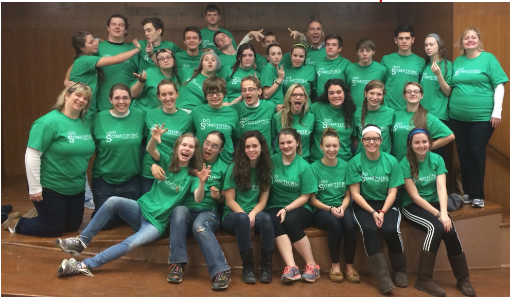
Teens participate in prayer and fellowship in the LifeTeen Fall "Let's Do Something" Retreat.