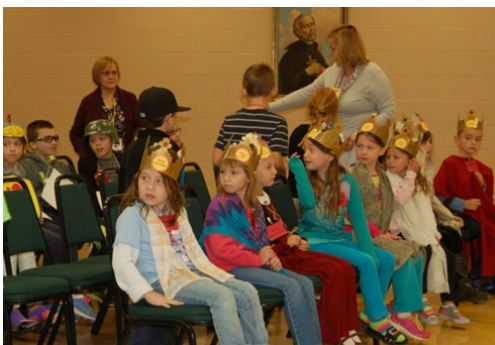
PSR elementary students celebrate All Saints Day on November 1st!

Thank you to our students for their donations to St. Vincent DePaul. Students will be hearing about their call to Stewardship and will be bringing home a paper to be filled out and returned to their catechist. Classes are in session November 22nd. No classes on November 29th due to Thanksgiving.