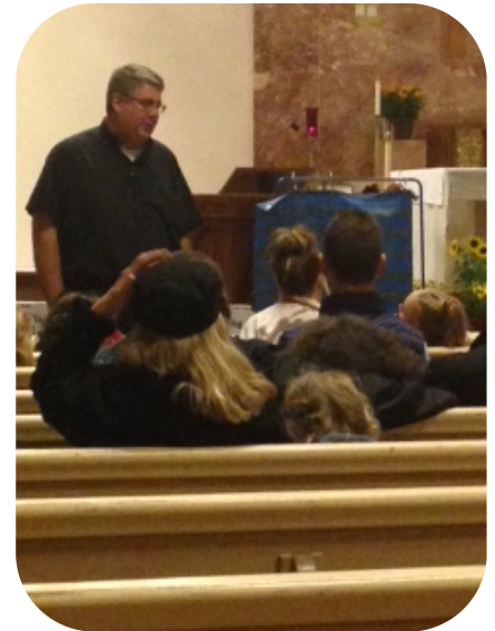
Have a blessed week!

I received a phone call the other day from a gentleman who cares for his handicapped daughter who called to alert me to the fact that some of the handicapped parking spaces in the parking lot are occupied by cars without handicapped tags. I would ask everyone's cooperation in reserving those spots for those who really need them during the weekend liturgies. And a reminder about keeping the far south portion of the parking lot with yellow striping open during the week as an aisle so that people can access the Church and rectory. On the weekends please fill all marked spaces, white and yellow all the way to the curb.