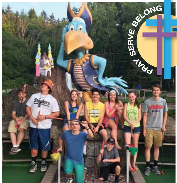
Our Life Teens had fun playing miniature golf this summer.