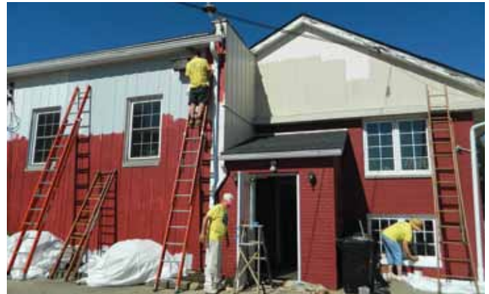
Parishioners finished the paint job at Cups Café in a mini Day of Service in August.

Invest a little more of yourself, and watch that return on investment grow.